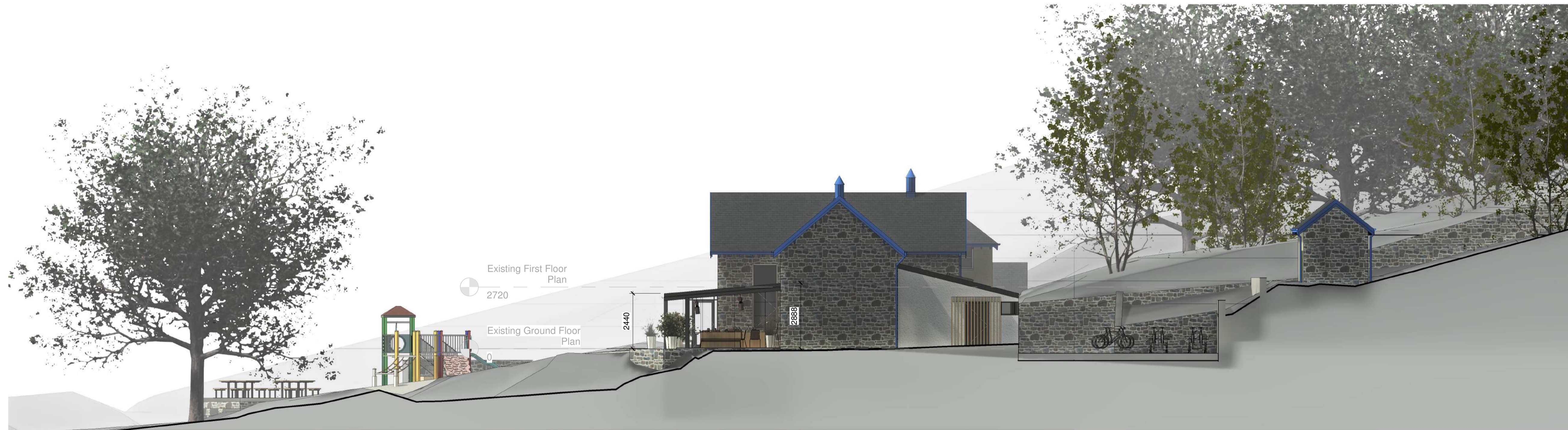
Proposed East Elevation 1 : 100

This document and its contents are copyright of studioEAST. All rights reserved. Any redistribution or reproduction of part or all of the contents in any form is strictly prohibited except with our express written permission. DO NOT SCALE FOR CONSTRUCTION PURPOSES. ACCURACY OF THIS DRAWING IN PRINT FORM CANNOT BE GUARANTEED. IF IN DOUBT... ASK!