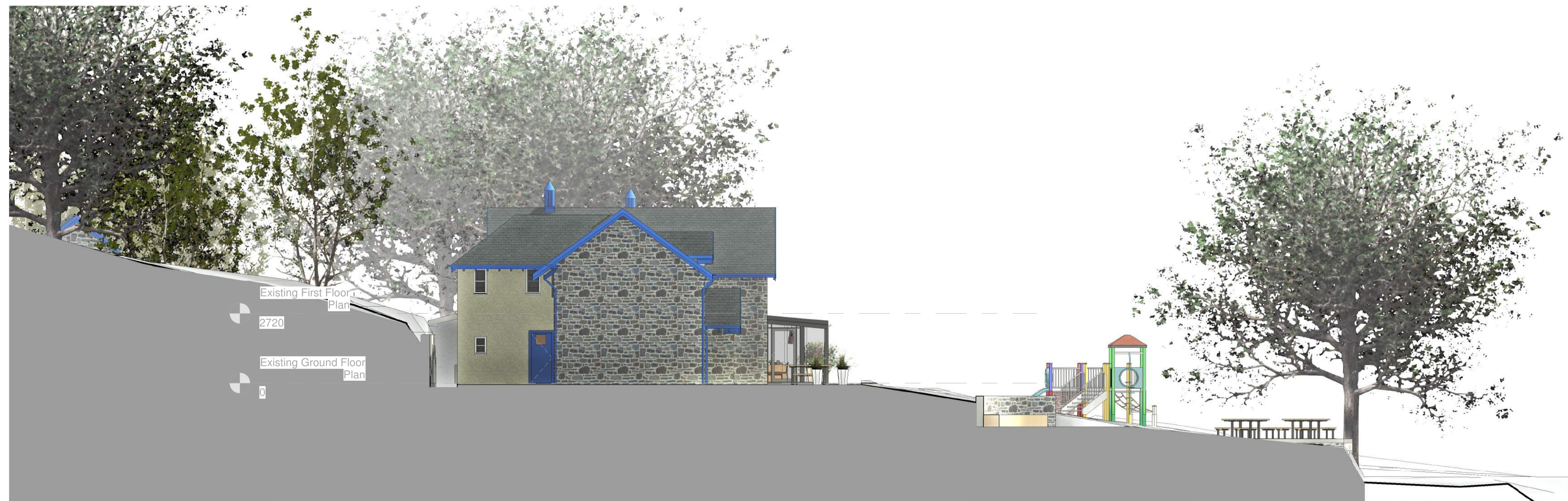
Proposed West Elevation 1 : 100